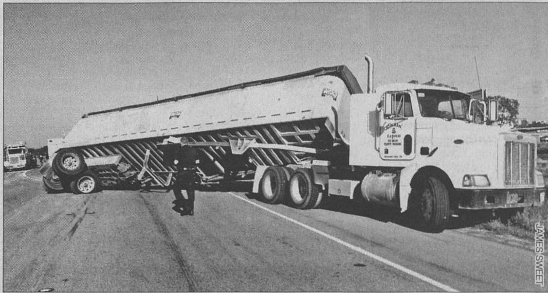
Pictured above is the 18-wheeler that was involved in the collision Tuesday morning with the Ford Explorer.